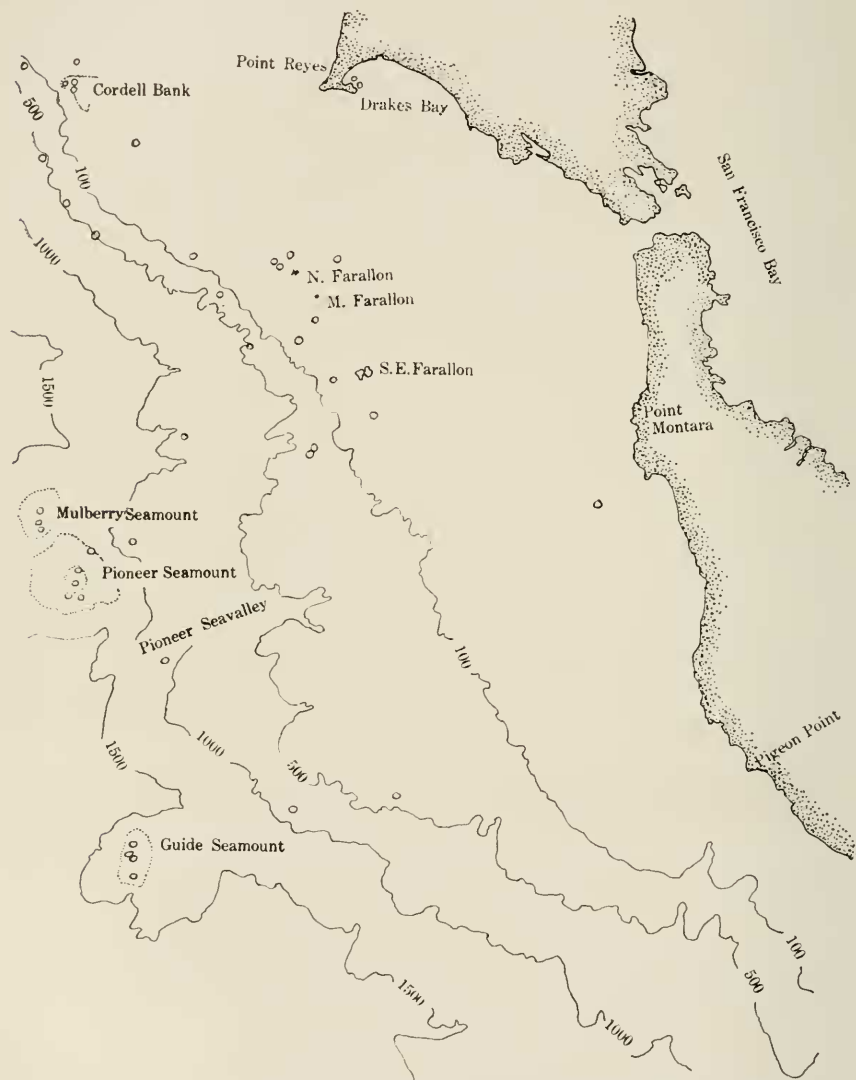
Figure 1. Sketch map of the area off central California where most of the dredging was done. Circles indicate some of the stations. Contour interval, 500 fathoms outside of the 100 fathom line.

of California as young as early Tertiary (San Onofre breccia for instance) contain detrital material which can be traced to no known outcrops. This has caused some to assume that at one time there was land of continental proportions west of what is now California, and from which eastward flowing streams brought these sediments. If these seamounts be remnants of such a land mass corroborative evidence would be at hand. Therefore we made